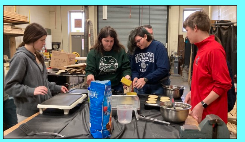
On the March 8 virtual day, some of the FFA students came to school to make a delicious breakfast for the staff.