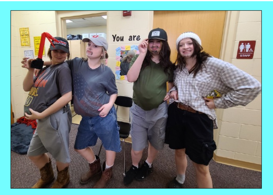
TMS teachers celebrate national FFA week by dressing up for BBQ Dad vs. Soccer Mom Day.

To submit a story or idea for Tidbits email lisa.moon@tecumsehlocal.org